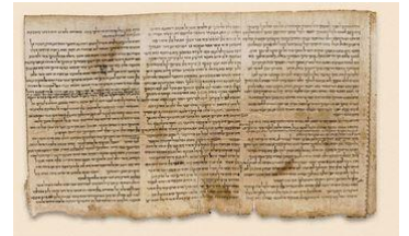
Dead Sea Scrolls

Mankind’s tendency to doubt has put science and the Bible seemingly at odds. While science is often changing and disproving theories, the Bible remains unchanged. Science doesn’t create new life but helps explain how masterful God’s creation is. And, only the “hand of God” could orchestrate the events with such perfect timing.