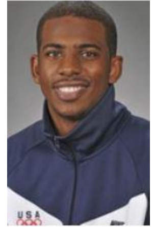
Olympic Champion Chris Paul

One of the great basketball players of our time, Chris Paul, is known as a charitable individual and all-around good guy. He is a celebrity spokesperson for State Farm Insurance because of his positive image. On the court, Chris is a fiery competitor, a good shooter and a sensational passer. He set freshman Wake Forest records for 3-point shooting, free throw percentage, assists and steals. Professionally he became a 5-time NBA all-star and member of two gold medal US Olympic basketball teams. Chris Paul's unselfish play made every team he played on a better team. In his sophomore season he led the Wake Forest basketball to a #1 ranking nationally late in the season. All was going well for Paul and Wake Forest University.